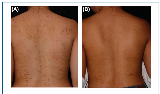
Figure 3. Patient with Fitzpatrick skin type IV and lichen planus pigmentosus at baseline (A) and 3 months post-treatment (B) with the 1,927 nm thulium laser. She received 5 treatment sessions over 19 months (15–20 mJ; treatment level, 5–7; delivered over 8 passes [total kJ, 1.26–1.46]).

the treatment depth, which is dependent on the energy applied, to the depth of the scar or wrinkle. The recommended treatment interval for patients with a history of postinflammatory pigment alterations is 6 to 8 weeks for both the 1,550 and 1,927 nm lasers. The risk of PIH in skin of color (FST IV–VI) is associated with the energy and density used. Prevention of bulk heating during laser treatment is important in smaller anatomical areas. Therefore, repeated back and forth motions over a